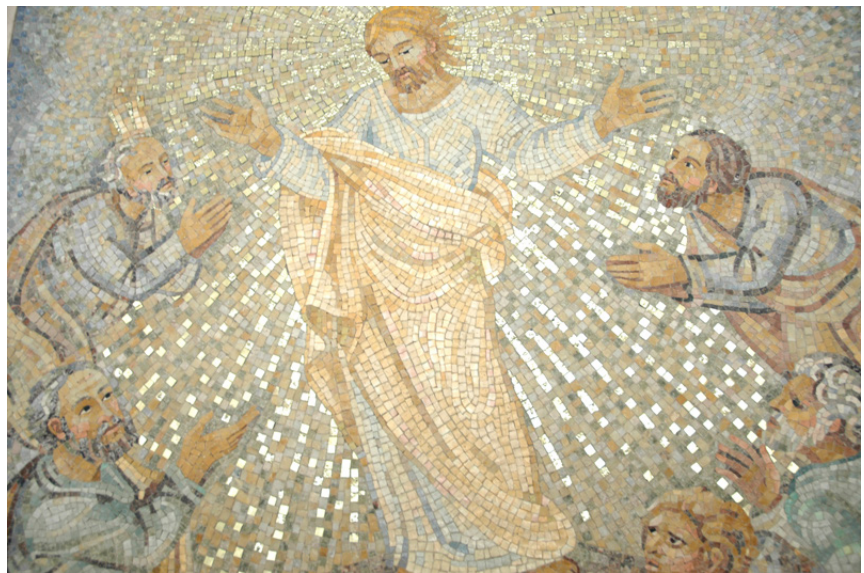
Mosaic, Basilica di San Pietro, Vatican City, Rome