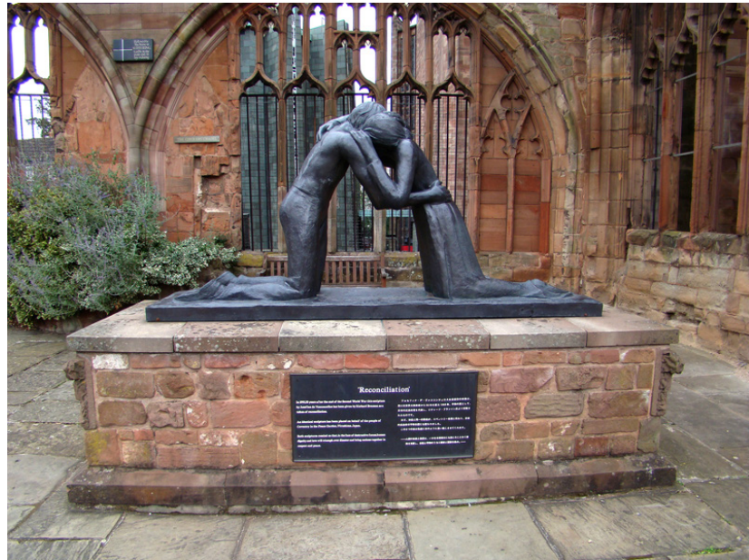
Josefina de Vasconcellos, Reconciliation , Coventry Cathedral, 1977